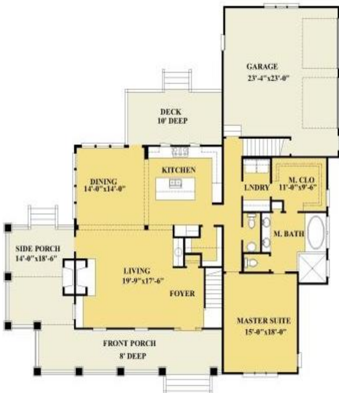
FIRST FLOOR PLAN HEATED SQUARE FEET 1722