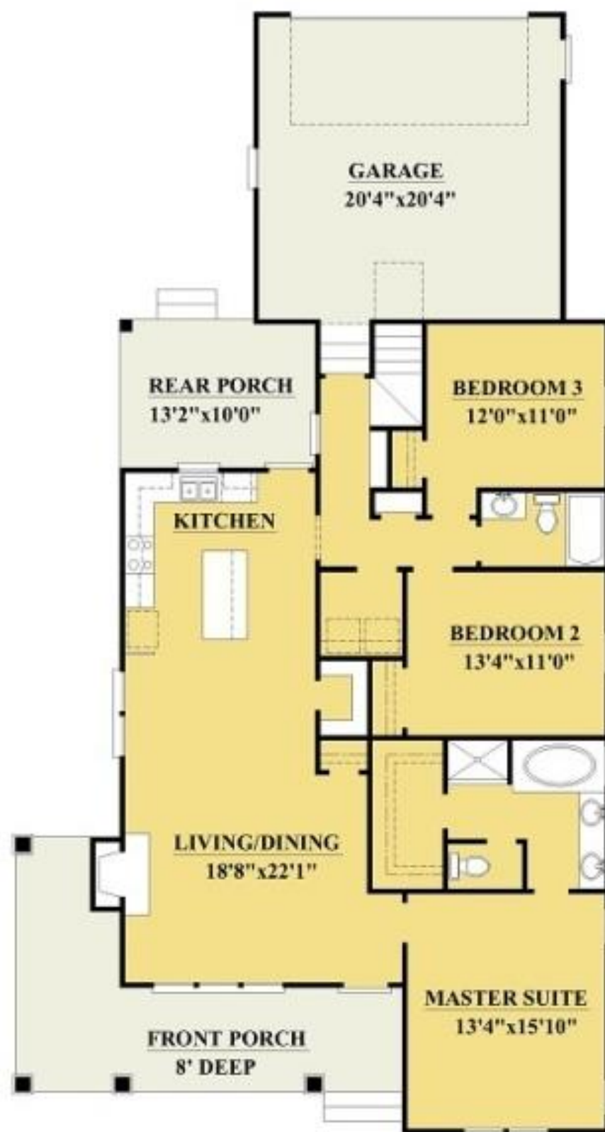
FIRST FLOOR PLAN 1487 HEATED SQUARE FEET